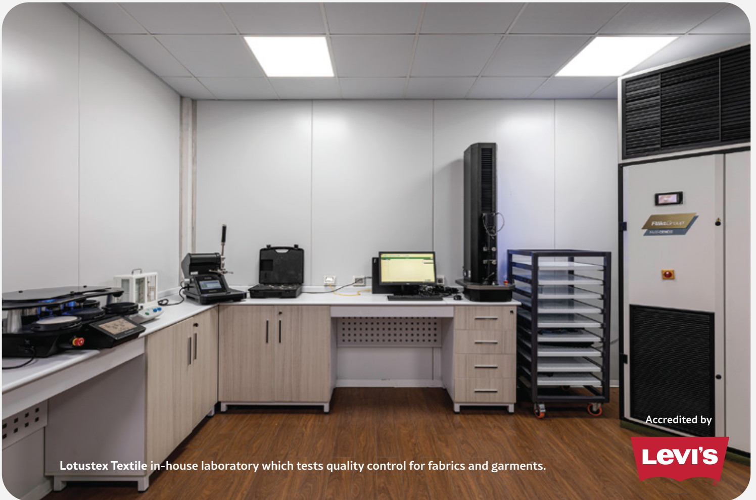
Lotustex Textile in-house laboratory which tests quality control for fabrics and garments.